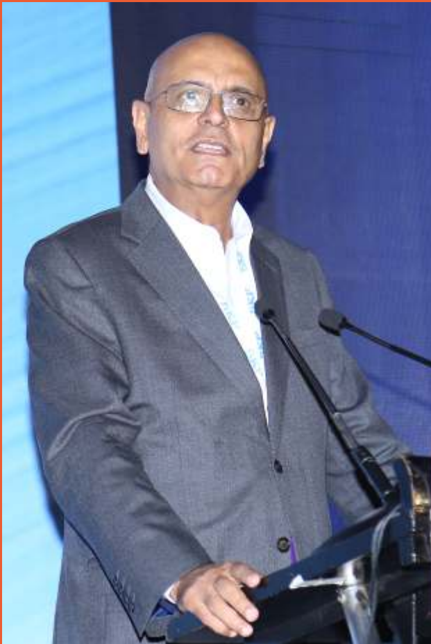
Select snapshots from our previous event