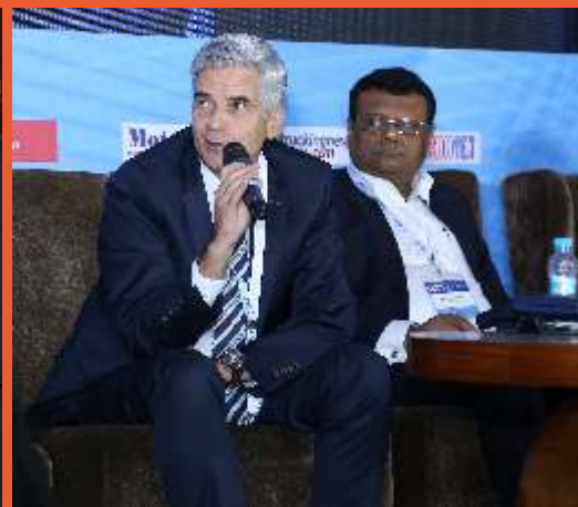
Select snapshots from our previous event